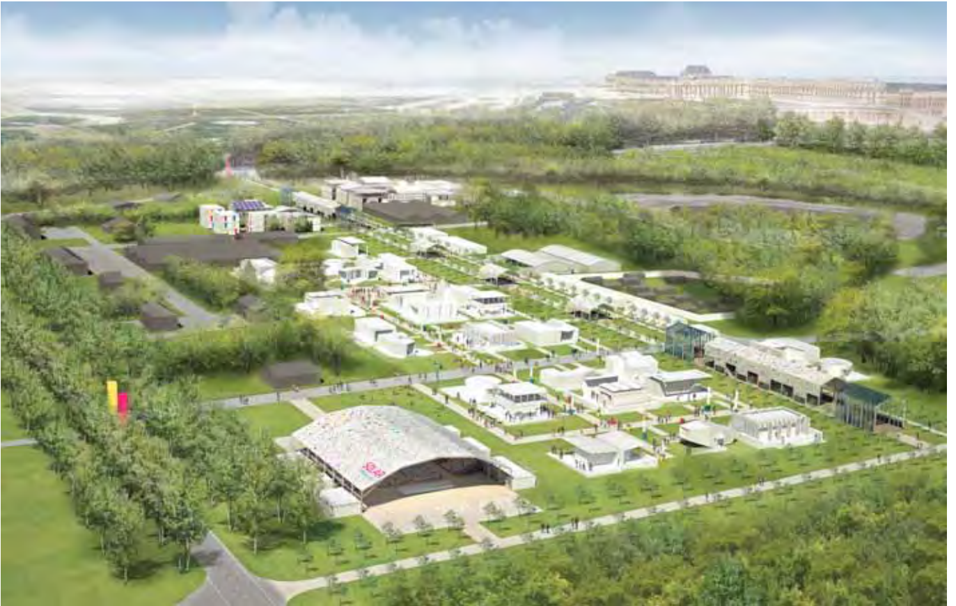
Digital rendering of La Cité du Soleil® made with Allplan and Cinema 4D – Nemetscheck and Maxon, official software partners.